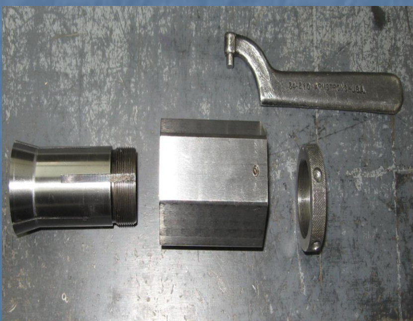
Fig 4 Disassembled view of collet block; left to right from top; collet wrench for tightening, collet that holds stock, block for mounting, and collet ring that screws into collet