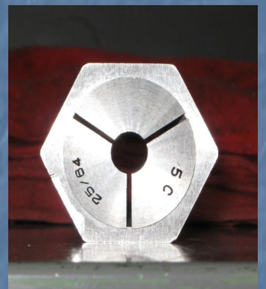
Fig 3 Front view of hexagonal collet; Stock goes into the middle hole